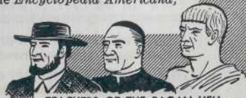
TEACHERS OF THE PAGAN HELL

therefore, says: "While there are many and significant variations of details, the main features of hell as conceived by Hindu, Persian, Egyptian, Grecian, Hebrew and Christian theologians are essentially the same." (1942 Edition, vol. 14, p. 82) You see, Christendom got her after-death torture ideas from the hells of the heathen and the purgatories of the pagans!