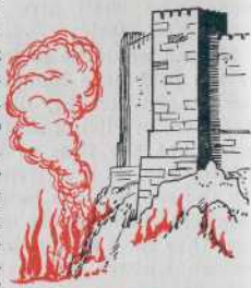
VALLEY OF HINNOM (GEHENNA)

Human courts of justice impose the death penalty, not torture, for the worst of crimes. God's justice is no less than man's. He is no fiend or sadist. He too decrees the death penalty, not torture, for the incorrigibly wicked, "everlasting cutting-off" from life, with no possibility of a resurrection. (Matthew 25:46) A fitting symbol, therefore, of such eternal destruction was the garbage dump in the